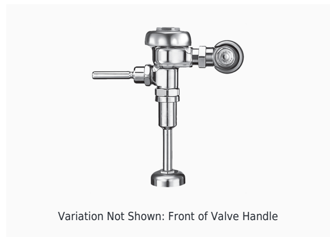
Variation Not Shown: Front of Valve Handle