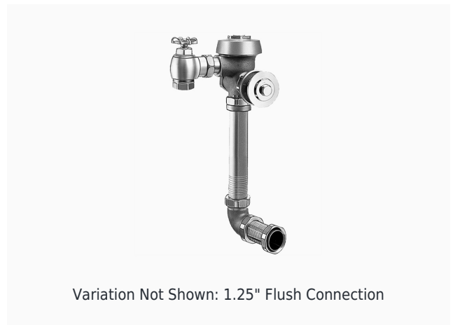
Variation Not Shown: 1.25" Flush Connection