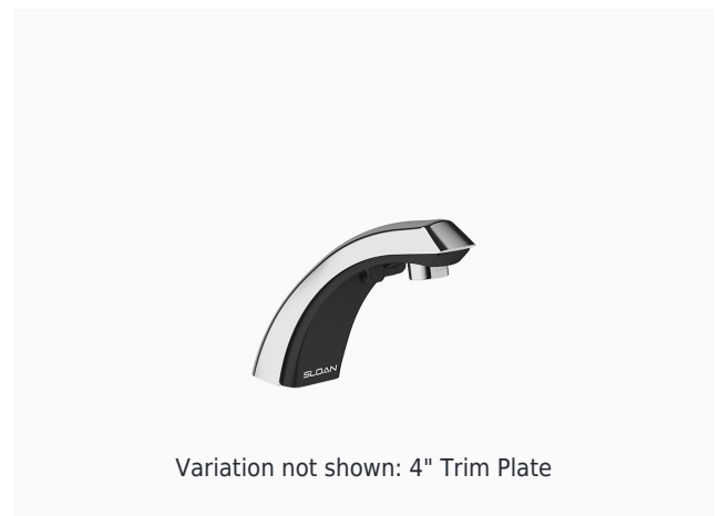
Variation not shown: 4" Trim Plate