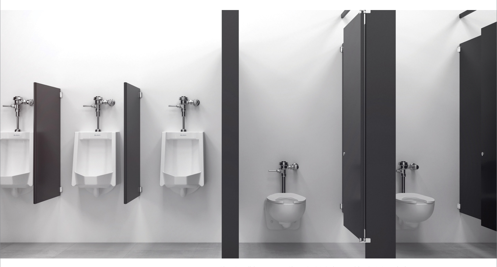
Sloan® Wall-hung Water Closet ST-2459 shown with ROYAL® 111 Flushometer and SU-1009 Urinal with ROYAL 186 Flushometer.