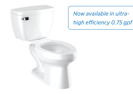
WETS-8009* Standard Series WETS-8029* ADA Series