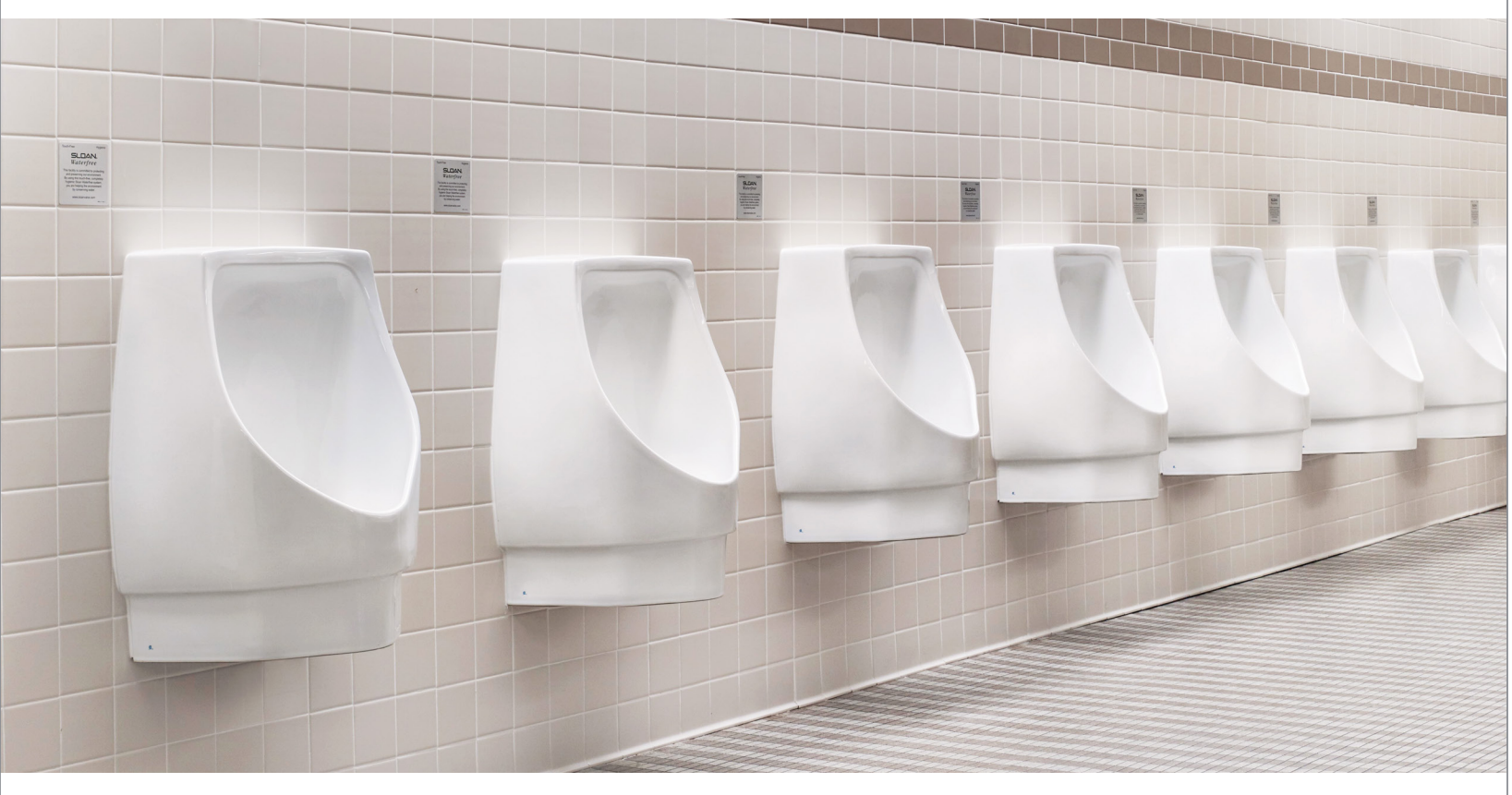
Sloan® Hybrid Urinal with JetRinse® Solution Technology HYB-1000 shown.