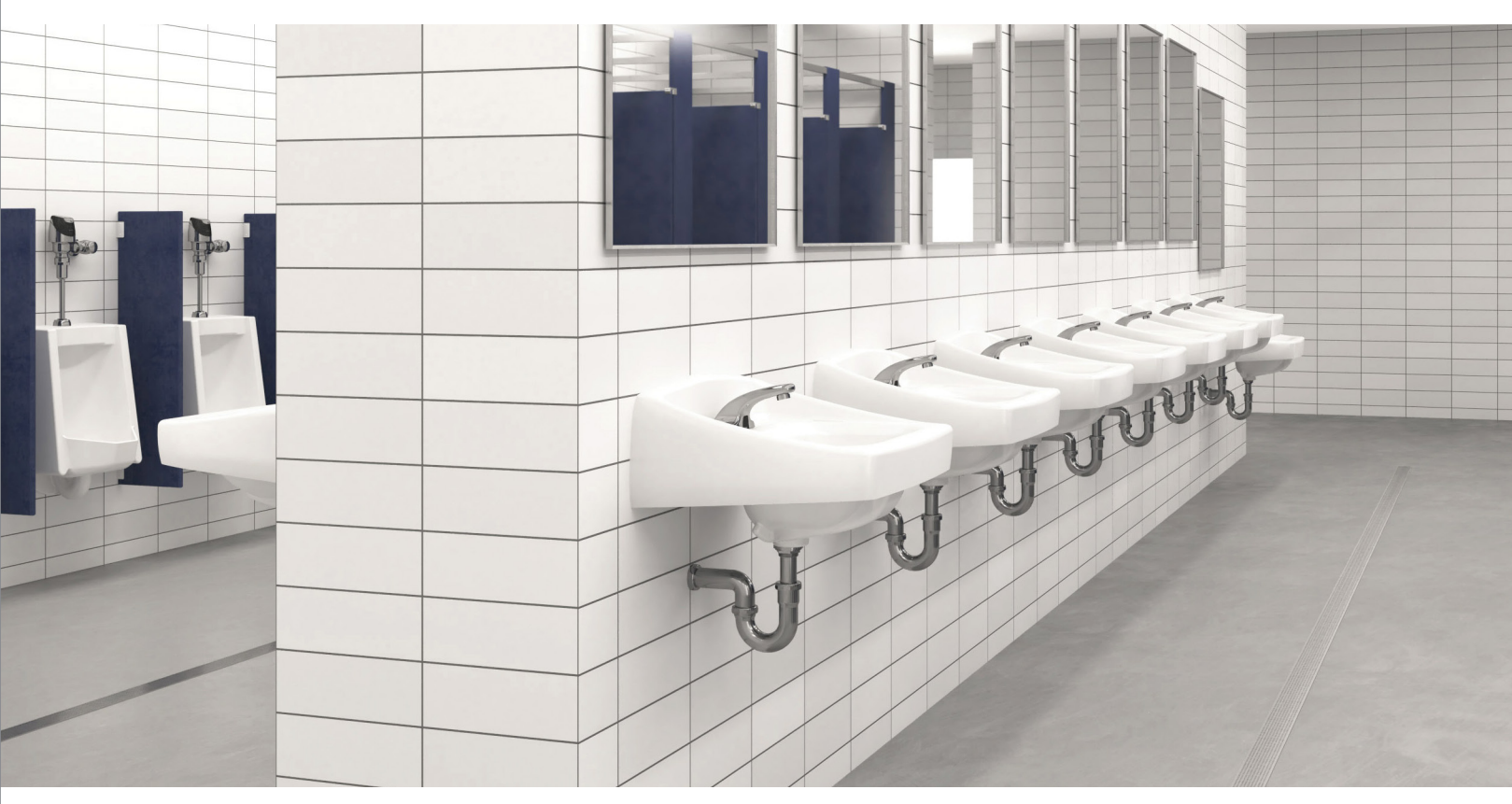
Sloan® Wall-hung Lavatory with 4" Backsplash SS-3103 shown with ETF-600 Faucet.