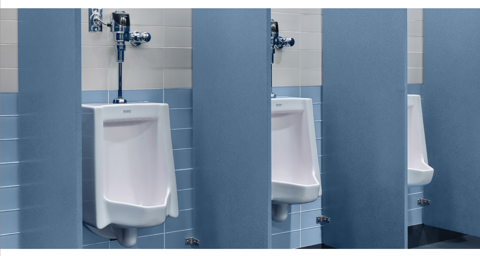
Sloan® Standard Washdown Urinal SU-1009 shown with ECOS® 186-HW Flushometer.