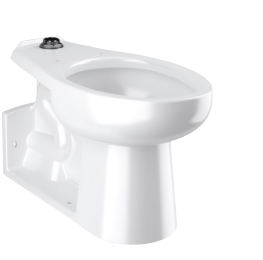
ST-2229 Top Spud ST-2229-BPL Top Spud Bed Pan Lugs