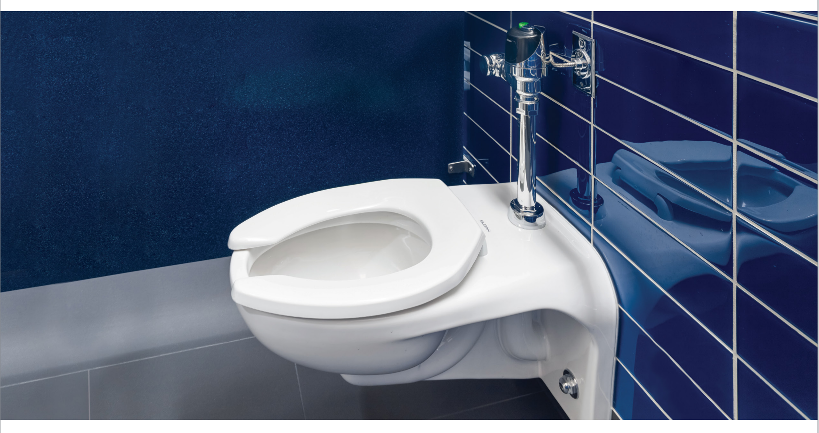
Sloan® Wall-hung Water Closet ST-2459 shown with ECOS® 111 Dual Flush Hardwired Flushometer.