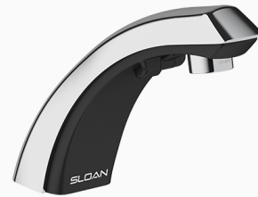
Image for a standard ETF-80 shown