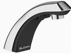
Image for a standard EBF-85 shown