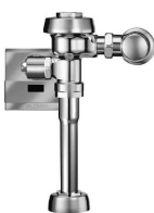
ROYAL 180 ES-S

For "L" Dimension longer than 12-3/4", add 5.30 per inch.