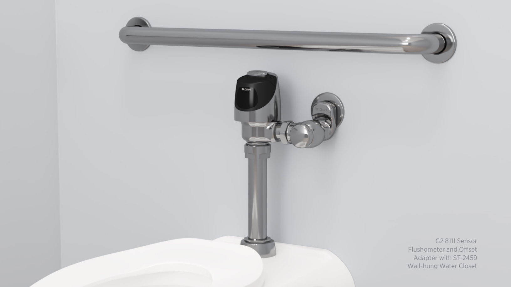
G2 8111 Sensor Flushometer and Offset Adapter with ST-2459 Wall-hung Water Closet