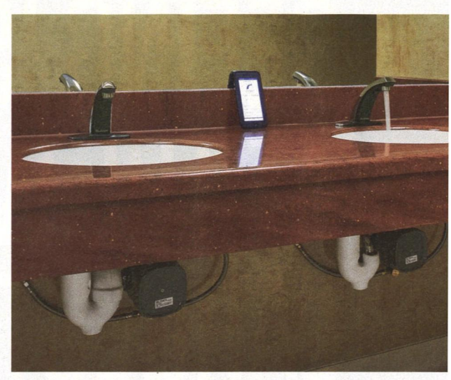
Hospitals are a breeding ground for germs and disease, and Sloan's Optima faucets help to promote proper hygiene with its touch free-application to cut down on cross-contamination.

he Vanderbilt University Medical Center (VUMC) is one of the largest academic medical centers in the Southeast, managing more than 2 million patient visits