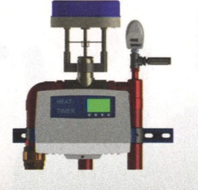
DIGITAL MIXING VALVE