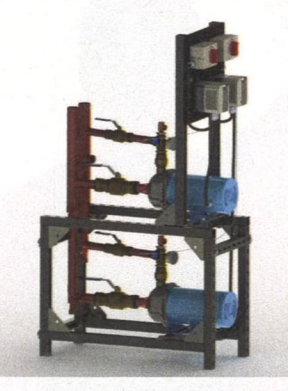
VFD WATER BOOSTER PUMP